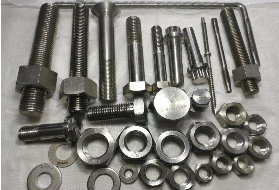
Precision CNC Machining Parts Hardware samples

hex flange head, 12 point flange head, double head bolt samples: